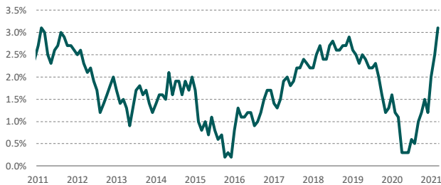
Chart of the Week - Producer Price Index (PPI) ex Food & Energy (y/y chg)

Legend: ● = All Clear; ● = Minor Concern; ● = Strong Warning